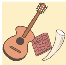
Things prohibited by the Washington Convention