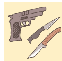
Model guns, Imitation swords