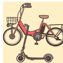
Electrically power assisted bicycles