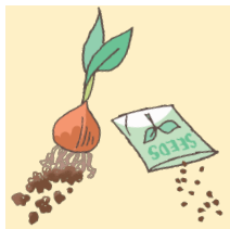
Seeds, Bulbs, Soil