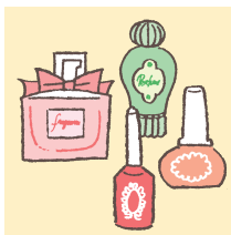
Perfume, Nail polish